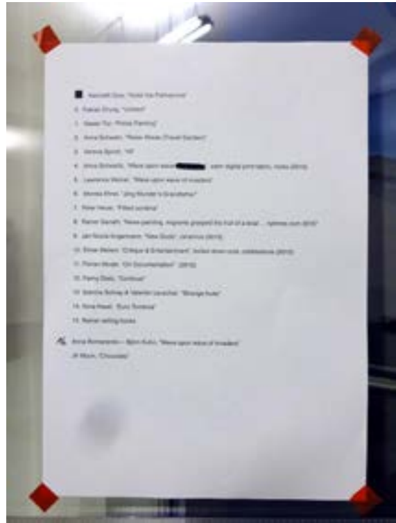
Gea Politi, A short history of Flash Art, Armada, Milan 5/12/2015