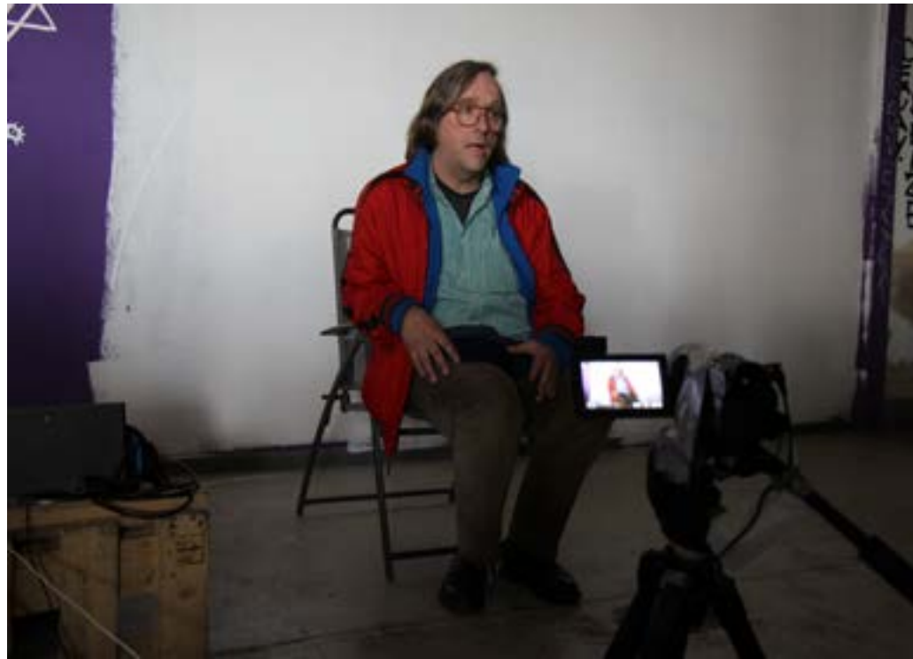
Manfred Pernice , On Strange Teaching, Kunsthaus Held, Leipzig, 5/16/2014