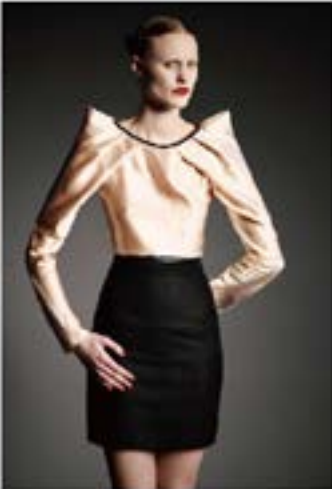
CEM CARO RE: Made in China, Outfit for a Los Angeles TV personality by Cem Caro, 2012 / 2013

BANK MAB SOCIETY Xianggang Lu 55-101 Shanghai 香港路55号101室上海 200002