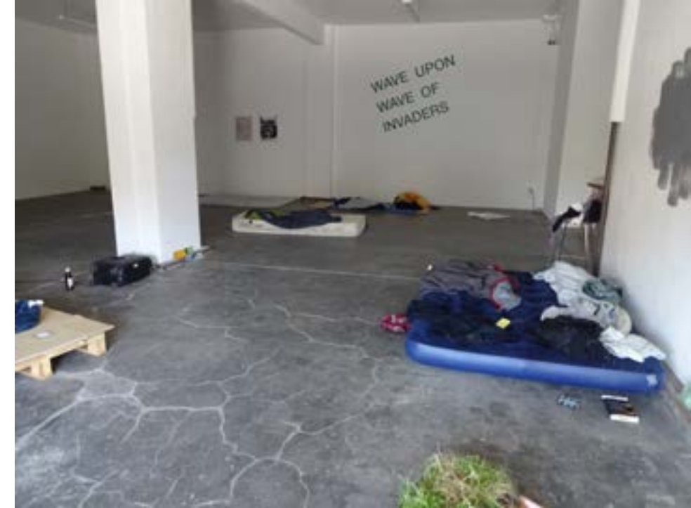
Strange Living @ Armada